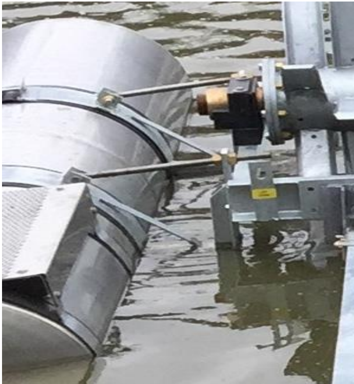
1600 SERIES CHANNEL FRAME